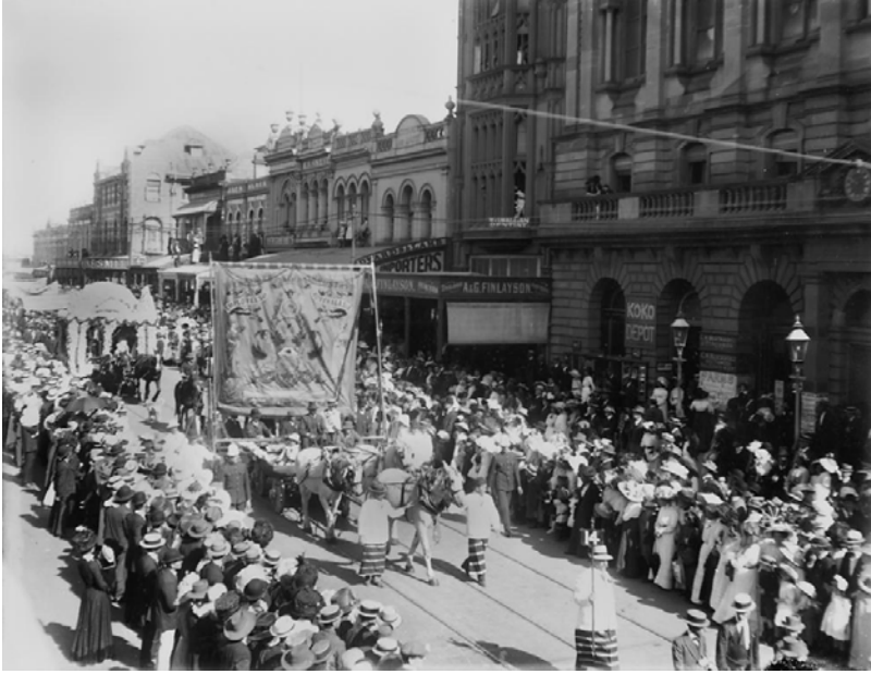
Figure 3 Eight Hour Day parade in Brisbane 1912