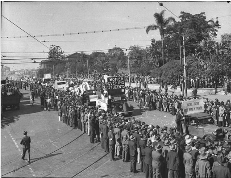
Figure 4 Women evening students' float on Park Street in the 1940s