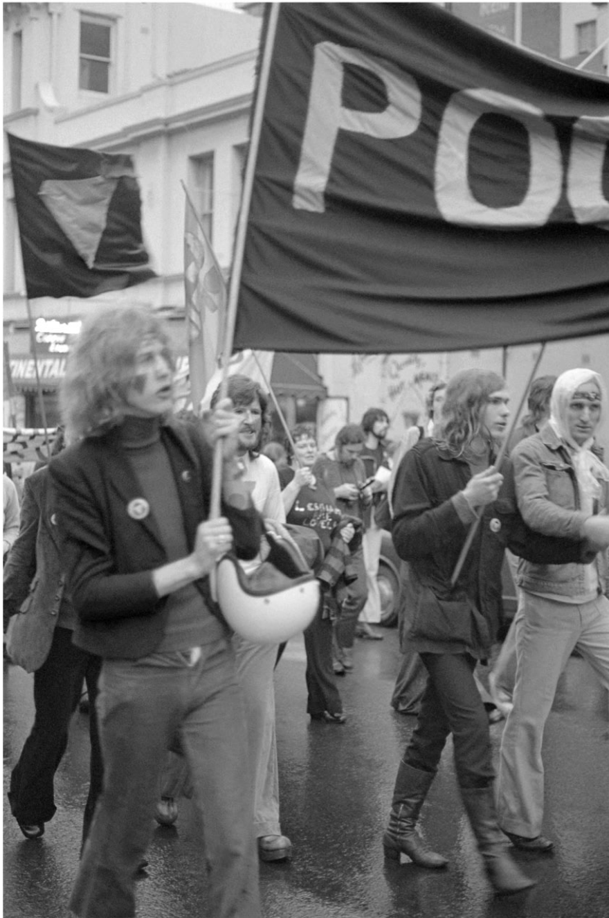
Figure 5 Ponch Hawkes Poofters! 1973, printed 2014 Digital C type print on Kodak Endura Matte © Ponch Hawkes