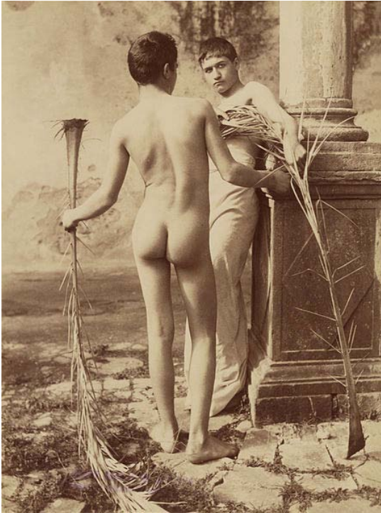
Wilhelm von Gloeden (1856 - 1931) Two Male Youths Holding Palm Fronds c. 1885 - 1905 Albumen silver 233 mm (9.17 in). x 175 mm (6.89 in) This work is in the public domain

The truth changes due to alterations of our values and understandings; “truth” is perhaps even constructed by our values and understandings. What an important statement this is with regard to the potential subversive nature of photography.