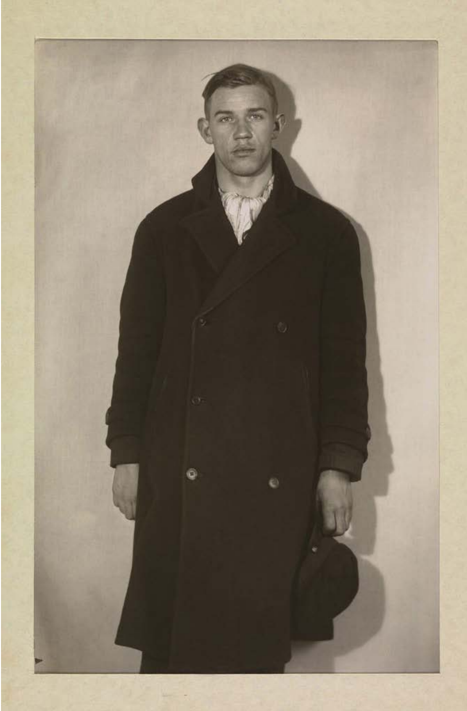
August Sander (1876-1964) Unemployed Man in Winter Coat, Hat in Hand 1920 Silver gelatin photograph mounted on paper Used for literary criticism under fair use, fair dealing