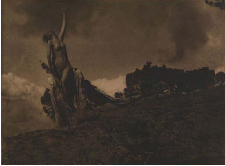
fig. 26 Anne Brigman Soul of the Blasted Pine, 1908, from Camera Work, no. 25, January 1909, photogravure, 61/8×81/4 in., Collection Susan Ehrens

fig. 25 Joe Deal Kite, Chino Hills, California, 1984, from the series "Subdividing the Inland Basin," gelatin silver print, RISD Museum: Gift of the Artist 2003.104.2